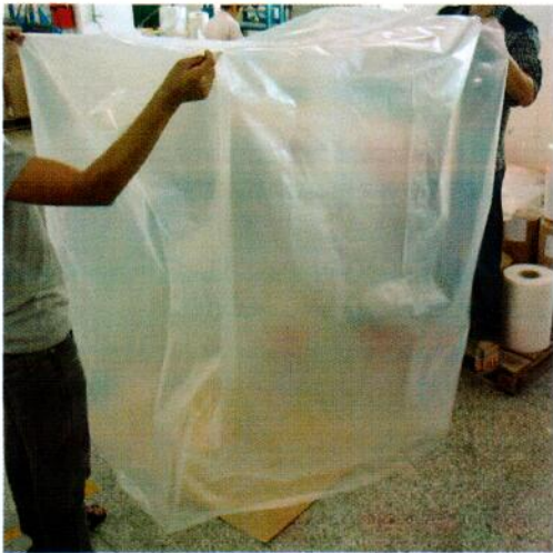
Transparent Plastic Bag at least 4XL, 10sheets/pack