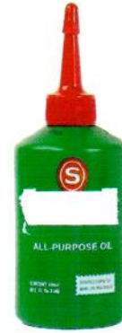
Oil for Shredder, 100cc