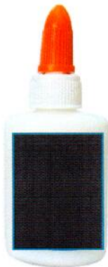
Glue, at least 40mL