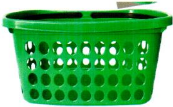
Basket, Plastic (Makapal), 25cm x 20 x 14cm (LxWxH)