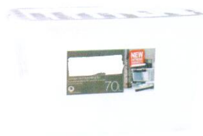
Storage Box, heavy Duty, Transparent, 70Liters