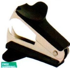
Staple Wire Remover, Pincher Type