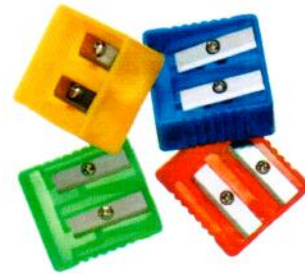
Sharpener, 2 holes