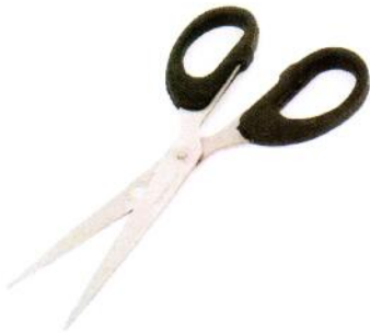
Scissor, Stainless, Rubber Handle, 7" min.