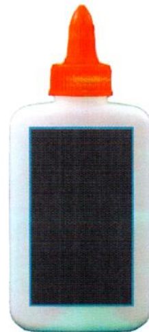
Glue, all purpose, 200g min.