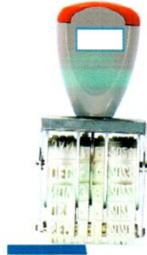
Dater Stamp, 12 years starting 2024