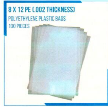
Plastic Bag (8x12), Transparent, Thicker than Sando bag