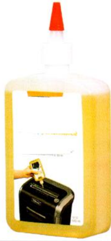
Oil for Shredder, at least 1Liter